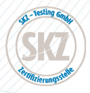
Dipl.-Ing. Helmut Zanzinger Certification Body

This certificate was first issued on 2018-01-15 and will remain valid as long as neither the harmonised standard(s), the construction product(s), the AVCP methods nor the manufacturing conditions in the plant are modified significantly, unless suspended or withdrawn by the notified factory production control certification body.